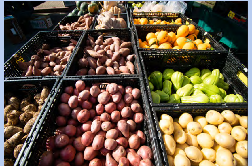
(Above) Fresh produce was available for attendees, like potatoes, squash, yams, lemons, and other seasonal vegetables.